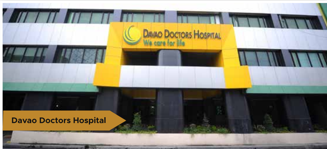
Davao Doctors Hospital