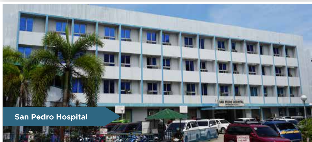
San Pedro Hospital